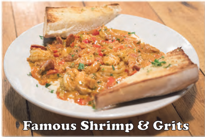
Famous Shrimp & Grits