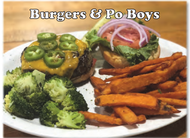
Burgers & Po Boys