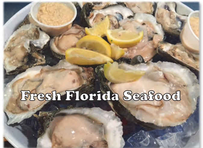
Fresh Florida Seafood

15271 McGregor BLVD #1, Fort Myers, FL 33908